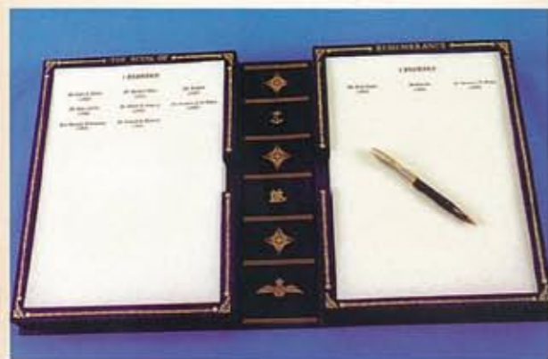
Every gift in memory is recorded here in our Book of Remembrance at our Richmond Home.

M aking a donation to The Royal Star & Garter Homes in memory of a friend, relative or loved one is a special way to remember them.