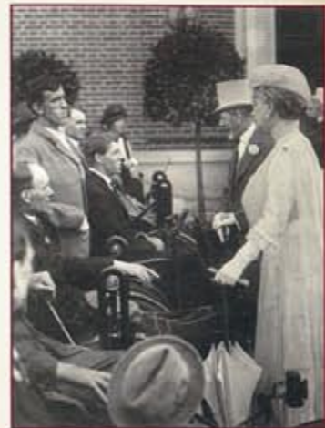
Queen Mary and King George open the Home in 1924

The Royal Star & Garter Charity was founded in 1916 by Queen Mary and the British Red Cross Society. Originally housed in the old Star & Garter Hotel, the current building was constructed between 1919 and 1924 and opened by King George V and Queen Mary. All the residents at that time were young men, many of whom were able to return home following a period of rehabilitation.