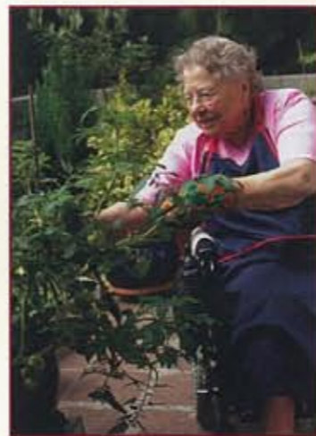
One of our residents enjoying the garden.

All gifts in memory receive an individual acknowledgement and the next of kin are advised of the names of donors and the total amount of the specific Memorial Fund. The name of the deceased is entered into our special Book of Remembrance under the date of death. Every day a page