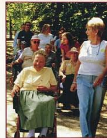
A gift in memory ensures our disabled veterans enjoy a better life.